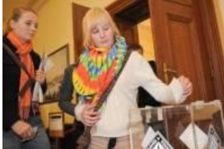
Photos: Discussions of students at the meeting of film club organizers. Students voting after the debate "Our Corruption"