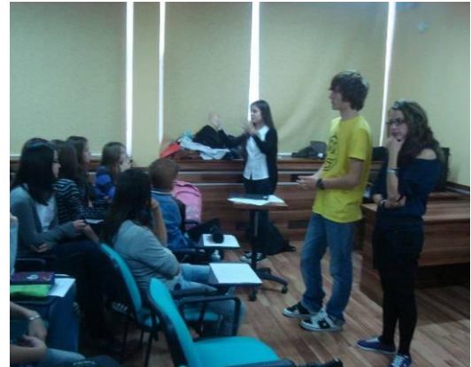
Photos: Students from Grigore Moisil high school at the documentary screening.