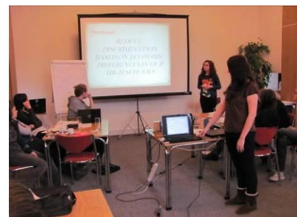
Photos: Students participating in a workshop at the International Thematic Meeting in Bratislava.