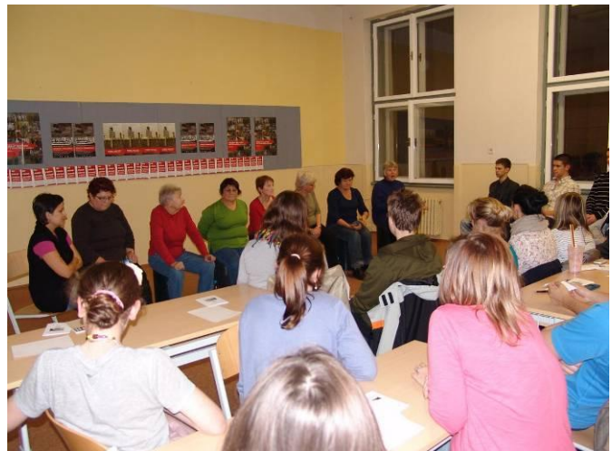
Photos: Theatre play by the „Třetí věk” (“Third Age”) theatre group. Discussion between students and actresses.